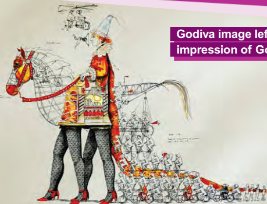
Godiva image left Artists impression of Godiva

The culmination of the Cultural Olympiad, the London 2012 Festival will open on 21 June 2012 – Midsummer's Day. It will run until 9 September 2012 – the last day of the London 2012 Paralympic Games. At the heart of the Festival will be a programme of commissions by some of the finest artists in the world.