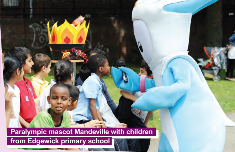
Paralympic mascot Mandeville with children from Edgewick primary school