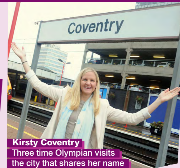
Kirsty Coventry Three time Olympian visits the city that shares her name

Coventry's plans to celebrate the cultural aspects of London 2012