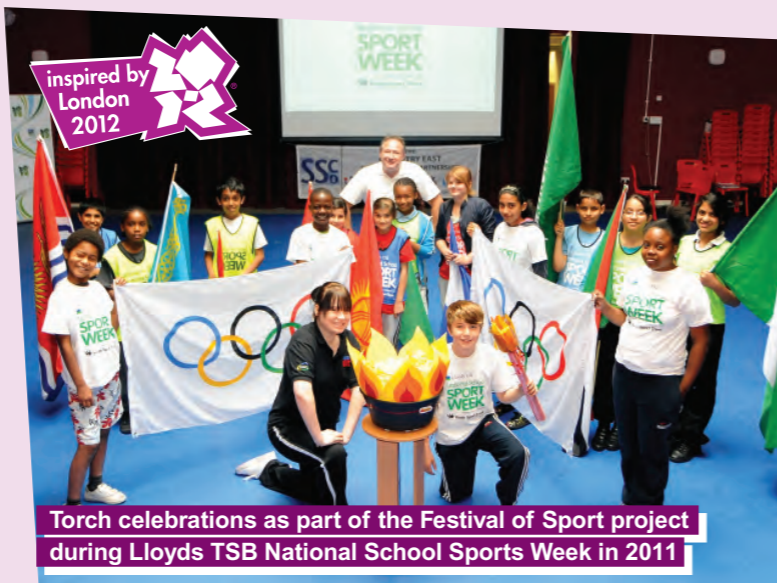
Torch celebrations as part of the Festival of Sport project during Lloyds TSB National School Sports Week in 2011

The 25-29 June 2012 is also Lloyds TSB National School Sports Week so you may wish to include your Torch Relay event to enhance any sporting activity planned to take place. Register at: www.schoolsportweek.org