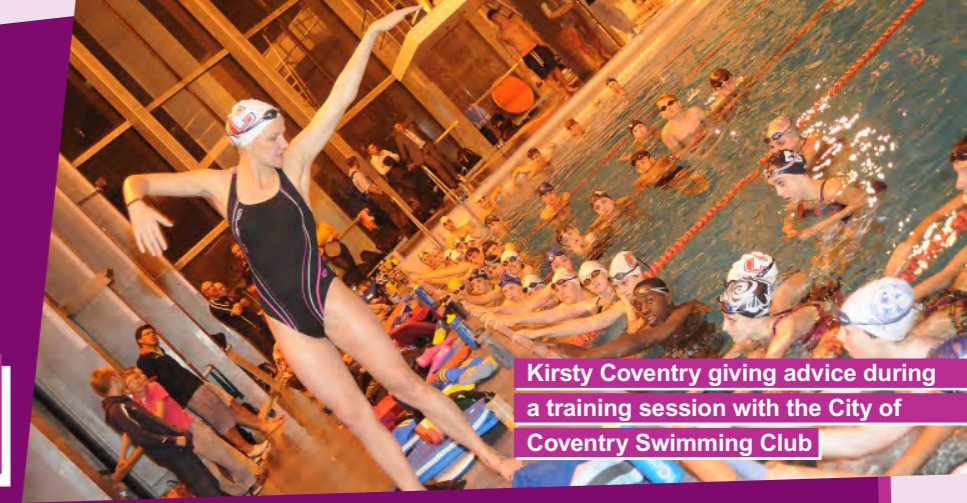
Kirsty Coventry giving advice during a training session with the City of Coventry Swimming Club

A seven-time Olympic medal-winning swimmer has returned to visit the city which shares her name following her first visit last year.