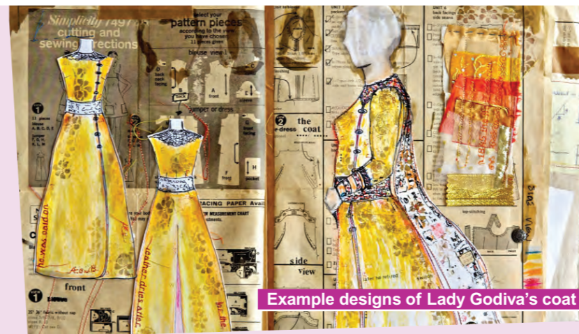
Example designs of Lady Godiva's coat

World renowned fashion designer Zandra Rhodes is also designing the undergarment for Godiva which highlights the quality of talent involved in Godiva Awakes.