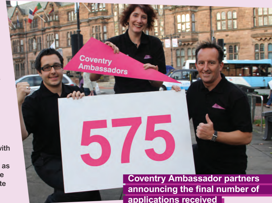
Coventry Ambassador partners announcing the final number of applications received

"We have a lot of passionate people who want to represent our city"