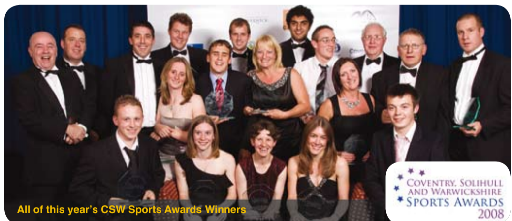
All of this year's CSW Sports Awards Winners

The fourth annual Coventry, Solihull and Warwickshire Sports Awards has been held at the Ricoh Arena, in Coventry, with the 2012 Partnership sponsoring the Young Sportsman and Young Sportswoman of the Year awards.