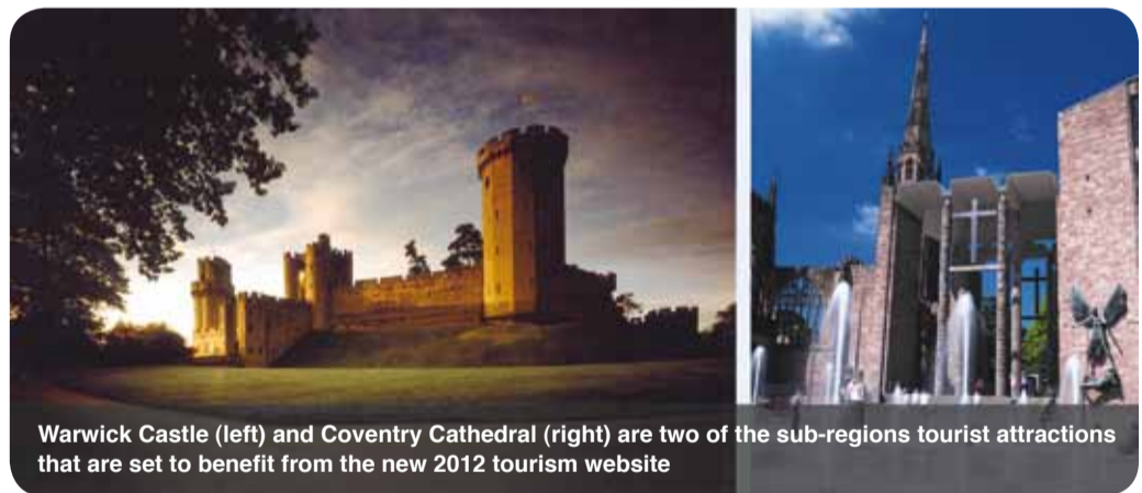
Warwick Castle (left) and Coventry Cathedral (right) are two of the sub-regions tourist attractions that are set to benefit from the new 2012 tourism website

A new website designed to support the UK tourism industry in the build-up to the London 2012 Olympic and Paralympic Games has been launched.