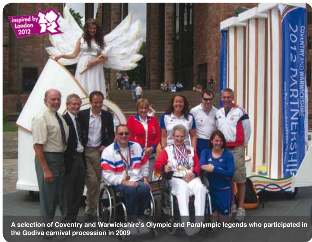
A selection of Coventry and Warwickshire's Olympic and Paralympic legends who participated in the Godiva carnival procession in 2009

Our local project which aims to inspire the people of Coventry and Warwickshire to celebrate the region's proud sporting heritage has received special recognition.