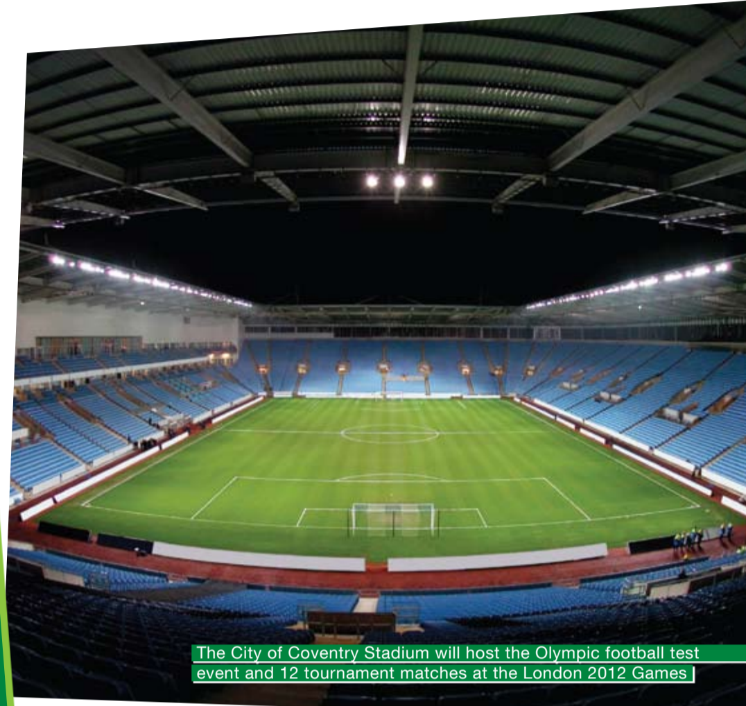
The City of Coventry Stadium will host the Olympic football test event and 12 tournament matches at the London 2012 Games

"We have a comprehensive schedule of events planned to celebrate the Olympic and Paralympic Games in Coventry and Warwickshire and we want local people to be part of London 2012, not only in their home country, but in their home city."