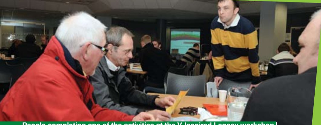
People completing one of the activities at the V-Inspired Legacy workshop

Interest in volunteering throughout Coventry and Warwickshire has received a boost following the opportunity for people to work as Games Maker volunteers at the London 2012 Games.