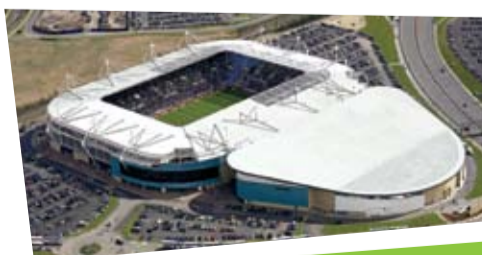
A Host for Olympic football

With such an impressive calendar of London 2012 inspired events and activities, we aim to unite our region, bringing communities together to celebrate this once in a life time opportunity, making Coventry and Warwickshire come alive in 2012, inspiring everyone to join in and be part of the greatest sporting event in the world. Don't miss out, be part of it and Get Involved now!