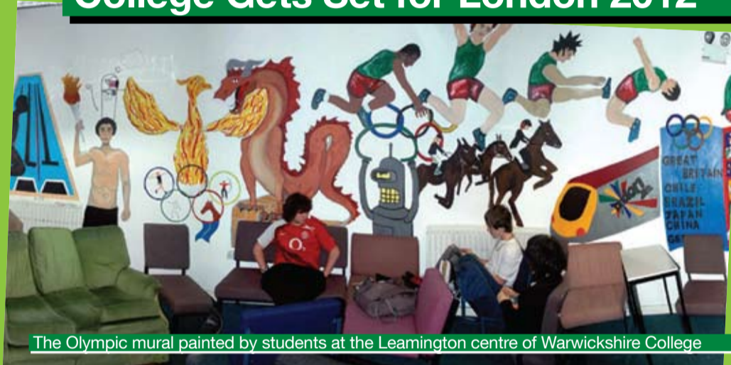
The Olympic mural painted by students at the Leamington centre of Warwickshire College

Warwickshire College has been recognised for its commitment to the Olympic and Paralympic values by the Get Set network, the Games' official education programme.