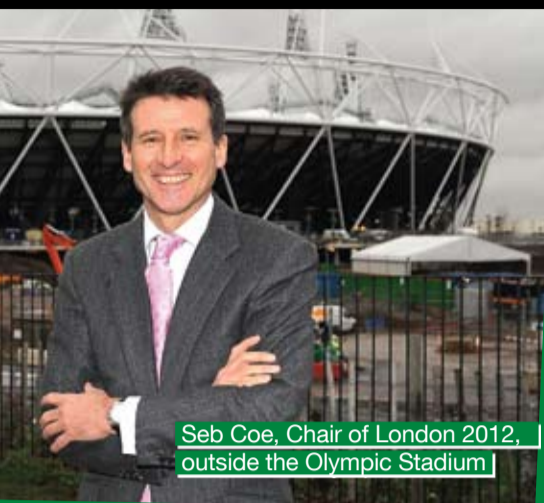
Seb Coe, Chair of London 2012, outside the Olympic Stadium

Sebastian Coe, Chair of London 2012, said: "Publishing the Olympic sports competition schedule means that everyone – athletes, coaches, spectators, broadcasters and everybody who wants to be part of London 2012 can now start planning their Games."