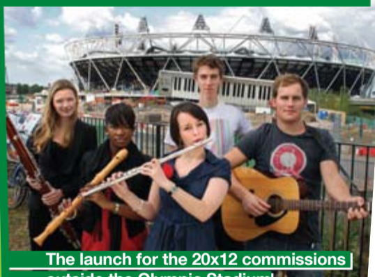
The launch for the 20x12 commissions outside the Olympic Stadium

PRS for Music Foundation have announced that the University of Warwick's Coull Quartet will play a key role in one of 20 outstanding pieces of new music which will feature centre stage of the London 2012 Cultural Olympiad.