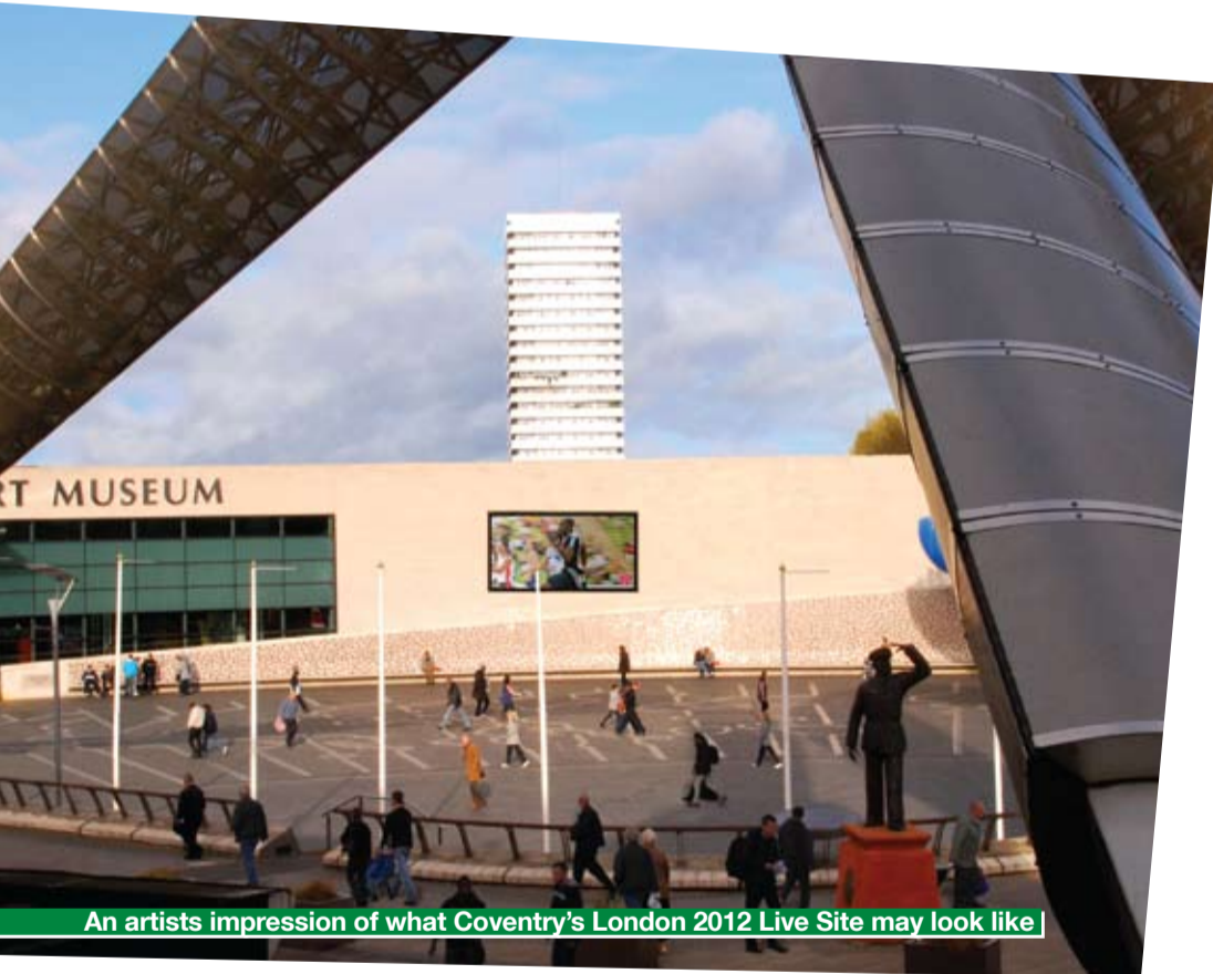
An artists impression of what Coventry's London 2012 Live Site may look like